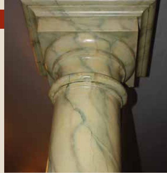
Crafted spruce wood pillars painted to look like marble.

What fascinates me is that those who refute authority, the Lord, Scripture, and authentic orthodox Christian denominational doctrines, need those things to legitimize themselves. But, since they don’t agree with them, they have to