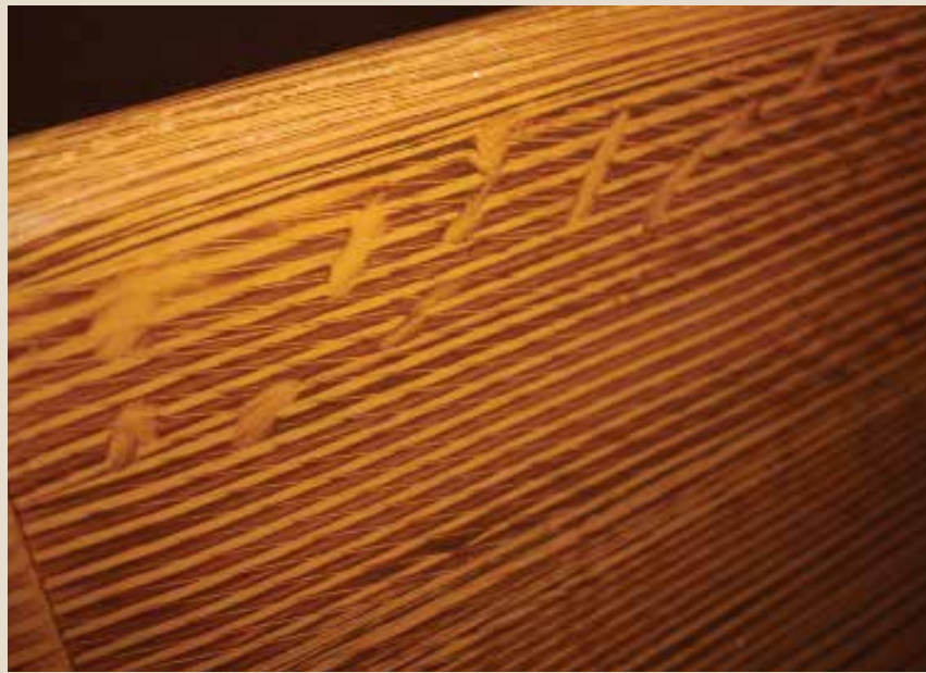
Close-up of intricately painted lines – some of them marred by smears – on a varnished spruce wood pew in the Salt Lake Assembly Hall located in Temple Square in Salt Lake City, Utah.

At The Bible Seminary the Gospel begins with “Repent!” not “Repaint!”