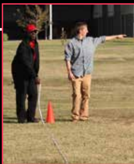
M. Div. students measure out the dimensions of the Exodus tabernacle in a nearby field.