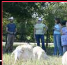
M. Div. students visit a local sheep farm for an up close and personal experience with sheep and their present-day shepherd.