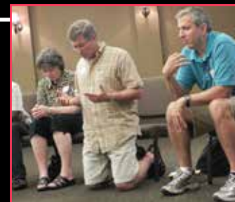
TBS Board, Faculty and Staff take time to worship and pray for one another at our Orientation Retreat.

(Above) Prior to worshipping in a representation of the tabernacle's Holy of Holies, M. Div. students simulate partaking in the Levitical sacrificial system by “killing” balloons representing calves.